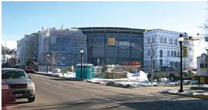
The new County Administration Center, scheduled for completion in fall of 2009, will consolidate offices currently located in four separate buildings in Newport.

In addition to these offices, the building will have a multi-purpose meeting room that will be used for