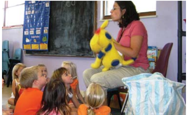
The Health Department provides many community programs each year, including this dog safety presentation at Crescent Springs Child Care Center.

To read the report, please visit http://www.nkyhealth.org/annualreport .