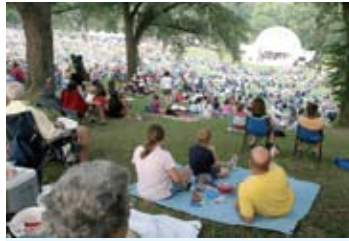
Take a TANK shuttle to the Summer KSO series in Devou Park this summer.

TANK service to the Summer KSO series at Devou Park is back by popular demand! On Saturday,