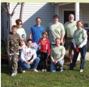
NKWD staff members volunteer through United Way on Earth Day to benefit NorthKey residents with their landscape.

NKWD is committed to providing a safe, clean and sufficient water supply through a reliable system at a reasonable cost to meet the needs of our current and future customers.