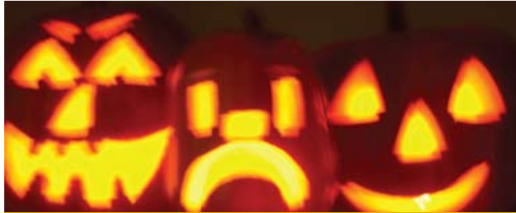
Enjoy Halloween fun on the Haunted Halloween Trail and the Great Pumpkin Races, October 23-24.

Snappy Tomato Pizza will be on hand selling pizza slices! There is a shelterhouse at the end of the Haunted Trail where survivors may wish to sample complimentary Bat's Blood or Orange Drool (donated by McDonald's) served by Ghostesses.