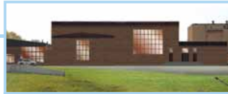
Memorial Parkway Treatment Plant

Construction began in May on two projects that will add new water treatment processes to the Memorial Parkway and Fort Thomas Treatment Plants. These processes will enable the District to meet new drinking water regulations going into effect in 2012. These regulations are unfunded mandates that we must meet as a water provider. The first process involves sending water through deep beds of carbon to remove compounds that are present in the raw water. The compounds removed by the carbon may be present naturally by leaves and sticks in the Ohio River that later react with chlorine to form minute levels of disinfection byproducts, or