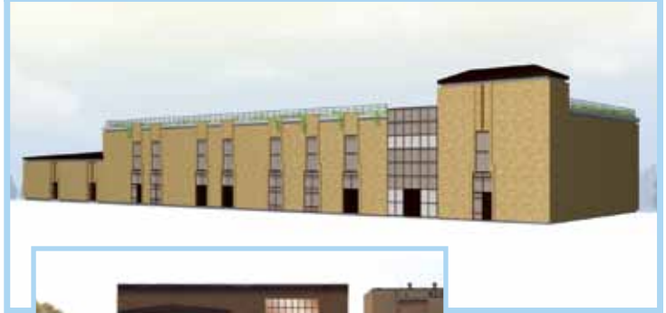
Ft. Thomas Treatment Plant