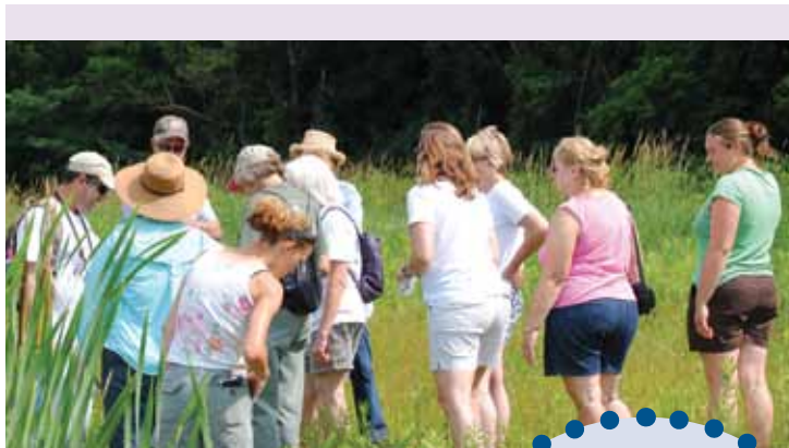
Master Gardeners visit Split Rock Conservation Park.

4-H is a non-formal education program open to all interested youth. Participants are between the ages of 9 and 18 and reside in every demographic area — rural, urban, and suburban. 4-H enables youth to have fun and meet new people and offers a wide range of projects, programs and activities that every member can do well, helping all youth to reach their fullest potential. 4-H youth learn by doing