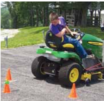
4-H youth learn by doing.

4-H is a non-formal education program open to all interested youth. Participants are between the ages of 9 and 18 and reside in every demographic area — rural, urban, and suburban. 4-H enables youth to have fun and meet new people and offers a wide range of projects, programs and activities that every member can do well, helping all youth to reach their fullest potential. 4-H youth learn by doing