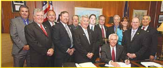
Kentucky legislators and community representatives witness the signing of House Bill 504.

On April 14, Kentucky Governor Steve Beshear signed House Bill 504 (HB 504) into law. This landmark legislation requires regulators to consider affordability in Clean Water Act compliance efforts for Kentucky communities and their residents.